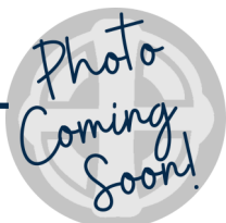
Minister for Family Life & Vocations