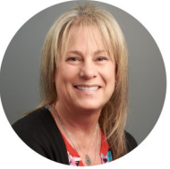
Patty Billinger Minister for Care & Social Justice