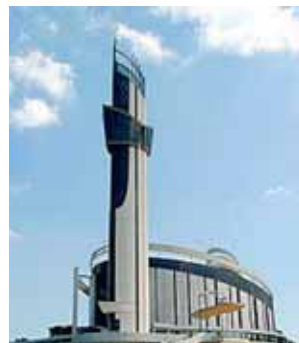
Shrine of the Divine Mercy, Cracow