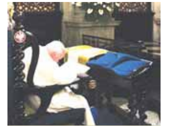
In the year 2000, Pope John Paul II decreed that on the first Sunday after Easter, the Liturgical Feast of Divine Mercy is to be celebrated